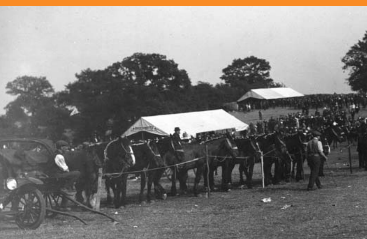
The Horse Fair at Barnet, 1921

In the early days of horse drawn transport the purchase, upkeep and use of horses was a necessary part of a mobile lifestyle. Today, horses are used for trotting, cart racing or merely as a symbol of wealth or prestige. The typical horse is a Skewbold or Piebold Cob, sometimes known as Gypsy Cobs or Tinker horses. These are robust horses that have been used for hundred of years for pulling wagons. They are renowned for their good temperament, strength and versatility and are recognised by their distinctive black and white, or brown and white colouring and feathered feet.