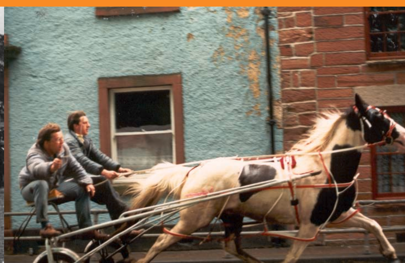
Racing at Appleby Horse Fair, Cumbria