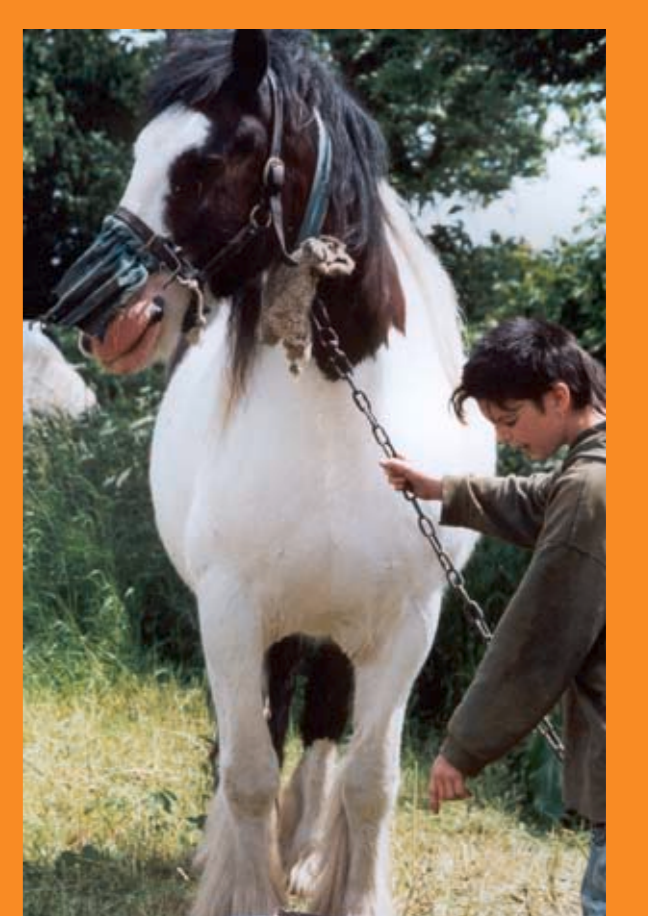
"Pitch & Luke" Image: Soo